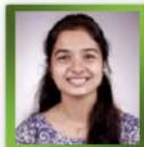
NIMA P R B.COM BANKING