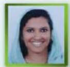
RISMA P M