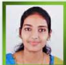
MERIN T T