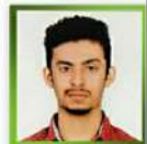
GIO P J