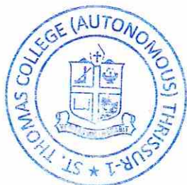
Principal St. Thomas College (Autonomous) Thrissur - 680 001