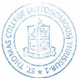
Principal St. Thomas College (Autonomous) Thrissur - 680 001