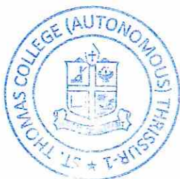
Principal St. Thomas College (Autonomous) Thrissur - 680 001