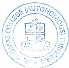
Principal St. Thomas College (Autonomous) Thrissur - 680 001