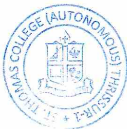
Principal St. Thomas College (Autonomous) Thrissur - 680 001