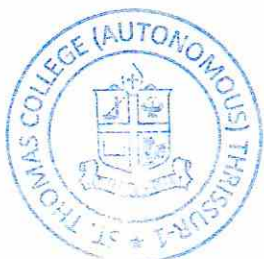
Principal St. Thomas College (Autonomous) Thrissur - 680 001