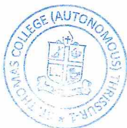
Principal St. Thomas College (Autonomous) Thrissur - 680 001