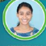
DERIN TREASA S