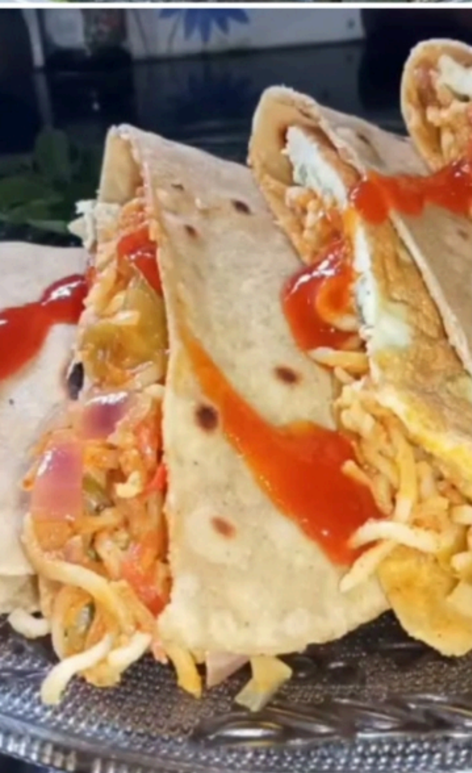
MIXED CHAPPATHY ROLL