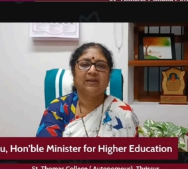
u, Hon'ble Minister for Higher Education