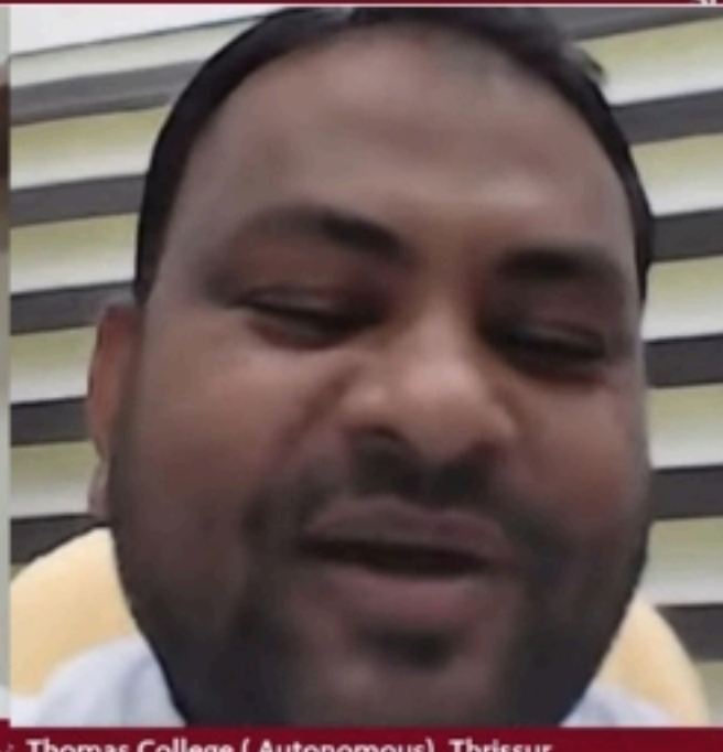
Ouseppachan, Music Director