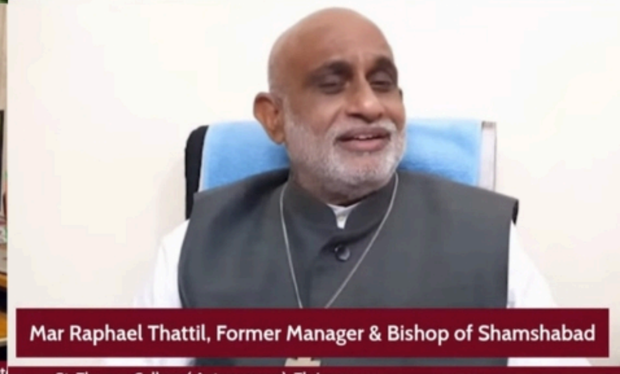
Mar Raphael Thattil, Former Manager & Bishop of Shamshabad