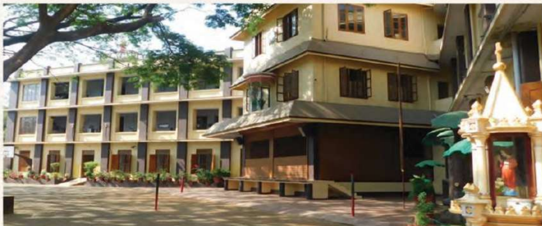
* Sacred Heart Convent School, Thrissur

He was a classmate of E. M.S. Namboothirippad at St. Thomas' College. Dr. Sukumar Azhikode described him as a poet who has the ability to look at human life as a pilgrimage and a rebirth and to develop that vision as beautiful and well framed portrait of a poem.