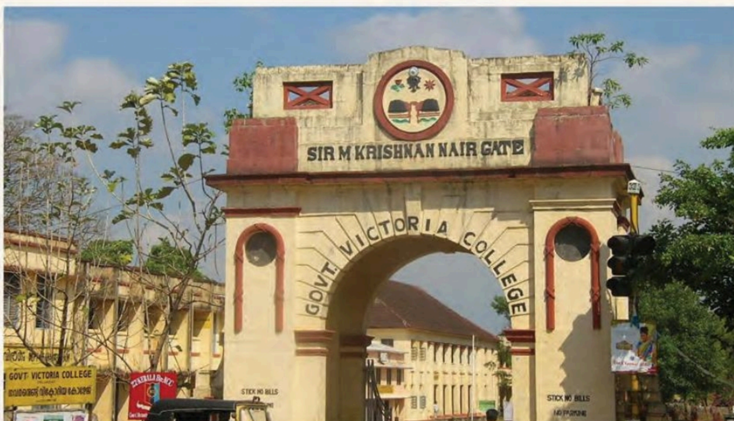
*Govt. Victoria College, Palakkad