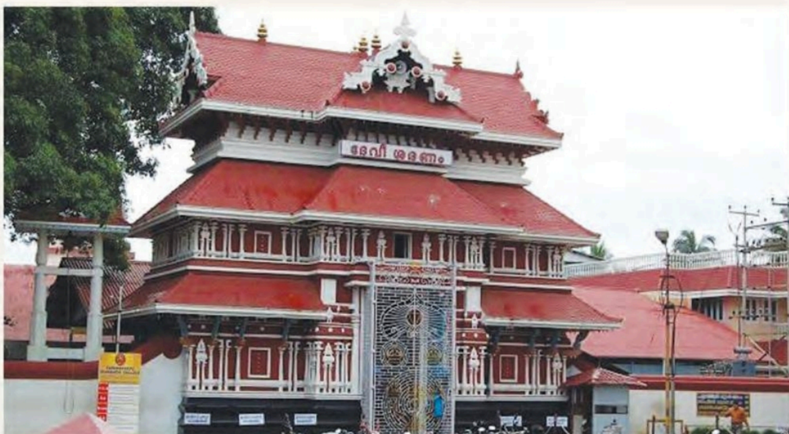
Paramakkattu Temple, Thiruvananthapuram