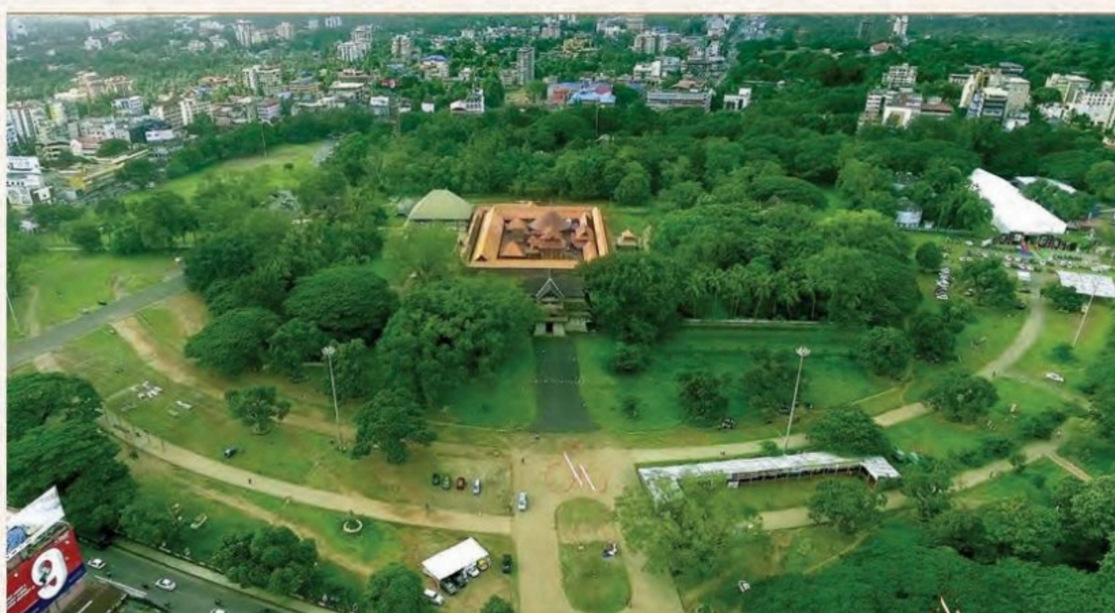
Swaraj Round, Thrissur

He was the President of Kodannur Panchayath, Member of Prohibition Commission, Member of Coconut Development Society, Campco, State President of Bharat Karshaka Samajam, Marketing Federation, Kerala Co-operative Union, Office bearer of Warehousing Corporation, Director of KSFE, President of Fruit-Vegetable-Tapioca Societies, and also Vice President of Cochin Central Co-operative Bank etc. He took the major initiative to begin the Thrissur Co-operative Spinning Mill. He breathed his last on May 13, 2004.