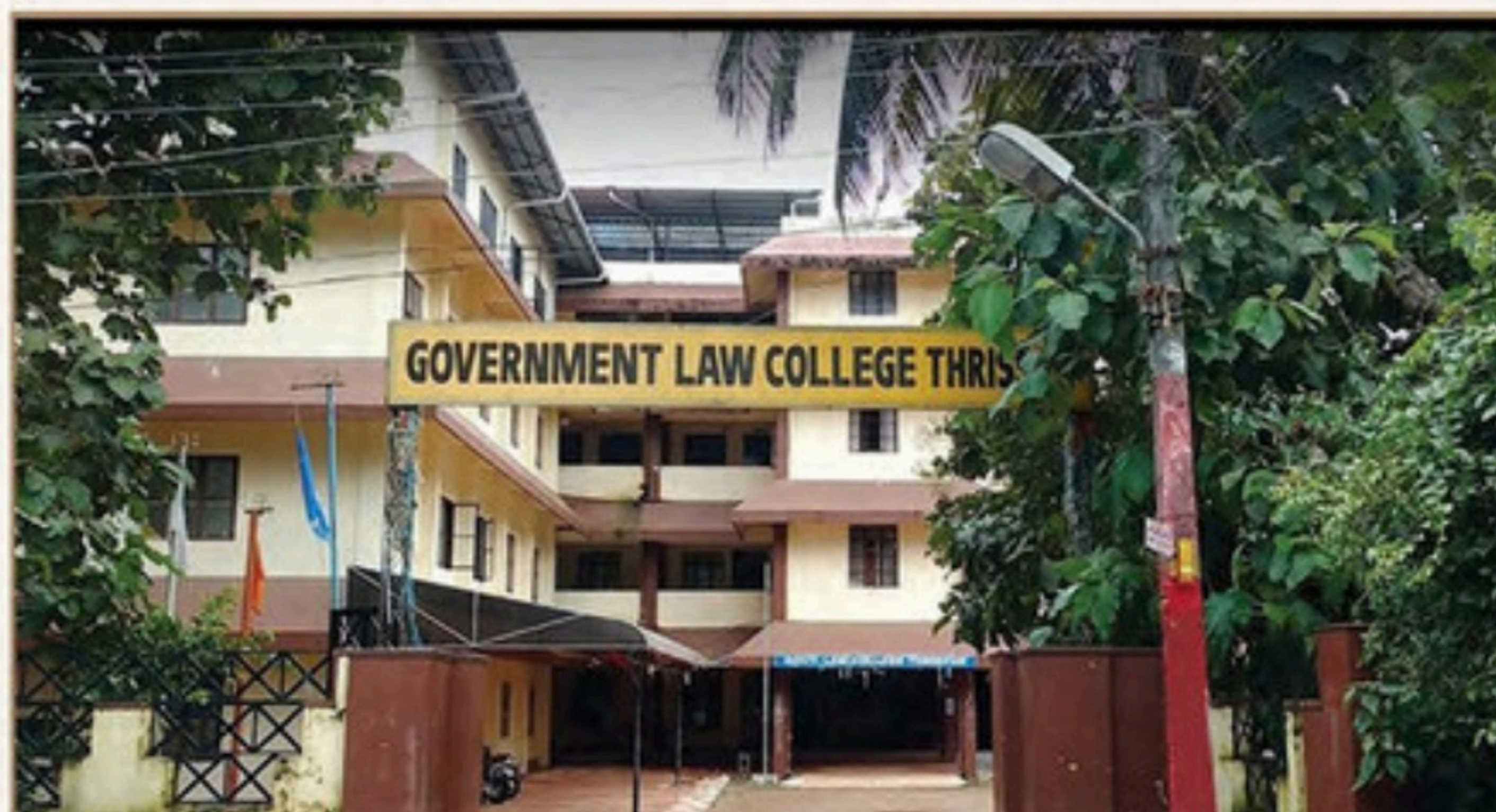
Government Law College, Thrissur