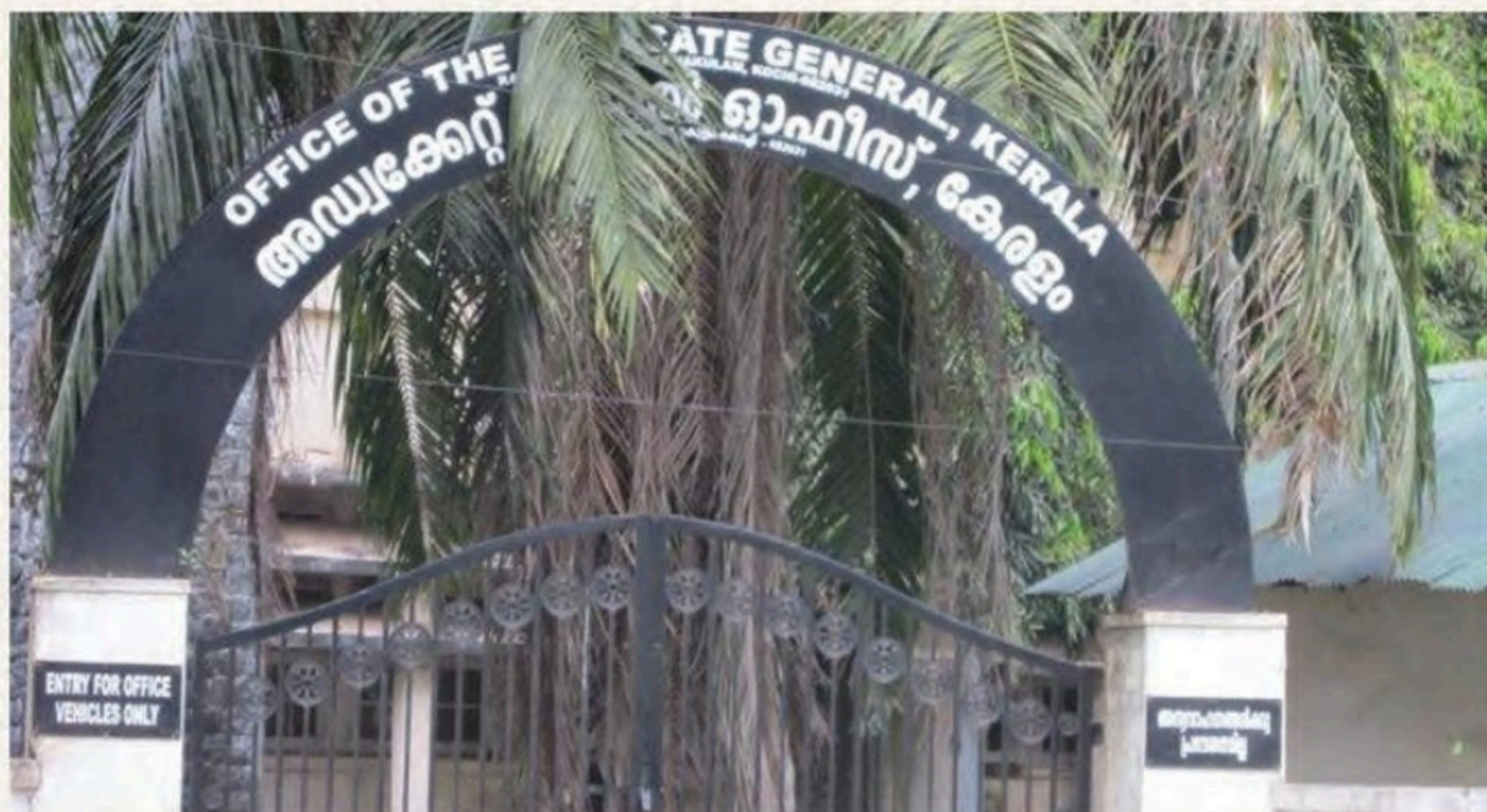
Kerala Advocate General Office