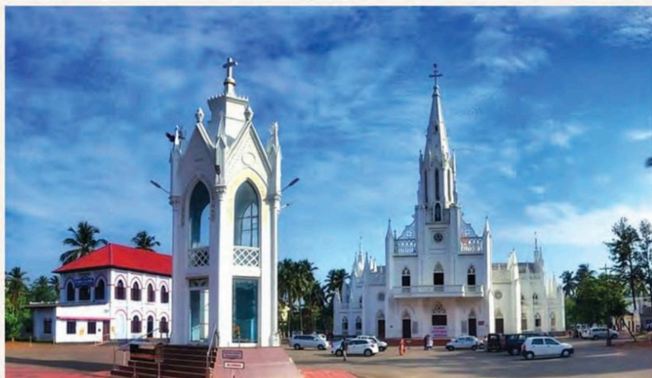
Lourdes Metropolitan Cathedral, Thrissur

He was ordained Bishop on 18 November, 2017. Currently, he is the Chairman of the Doctrinal Commission of the KCBC as well as the Syro-Malabar Synod of Bishops. He is also the Chairman of two Research Institutes: the PAROC Research Institute, Thrissur and the Liturgical Research Institute, Kakkannad.