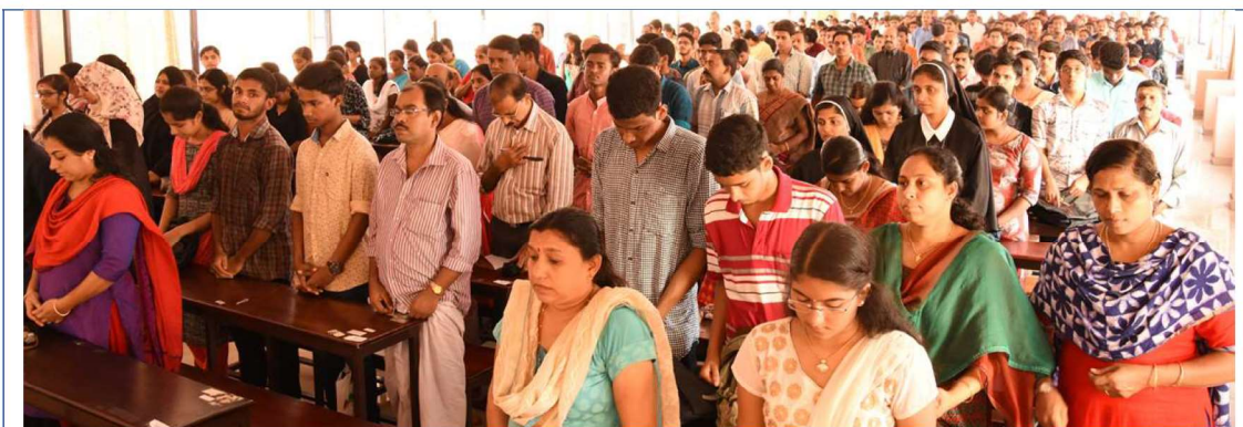
Students Induction Programme for the newly admitted postgraduate Students